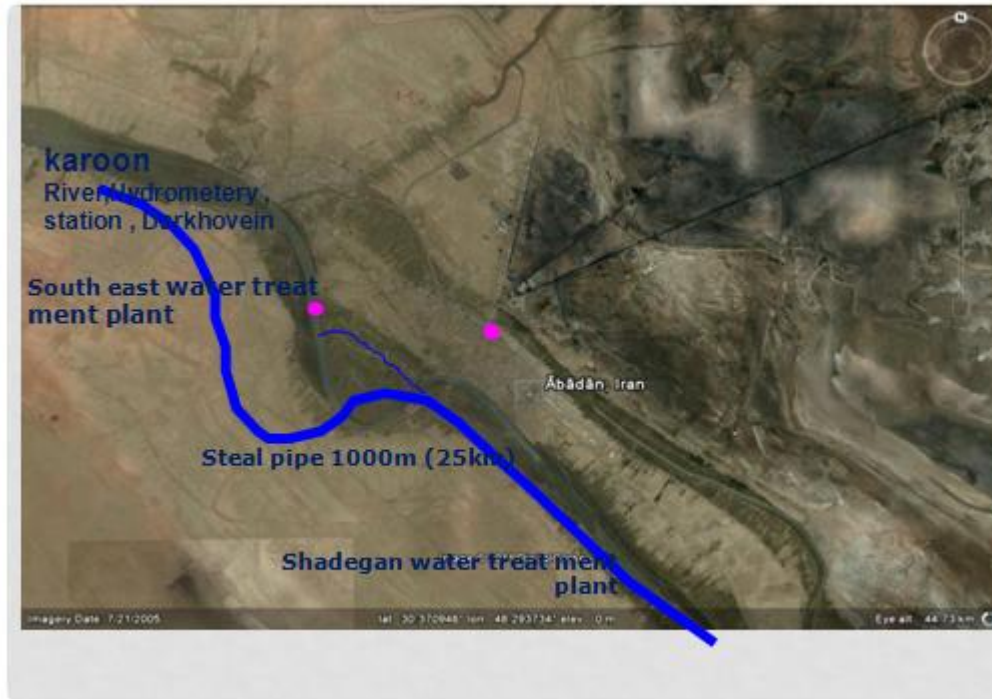
Figure 1: Water uptake point in Karun River and the pipeline from the river to Shadegan city